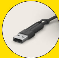
USB C and USB A connectors included