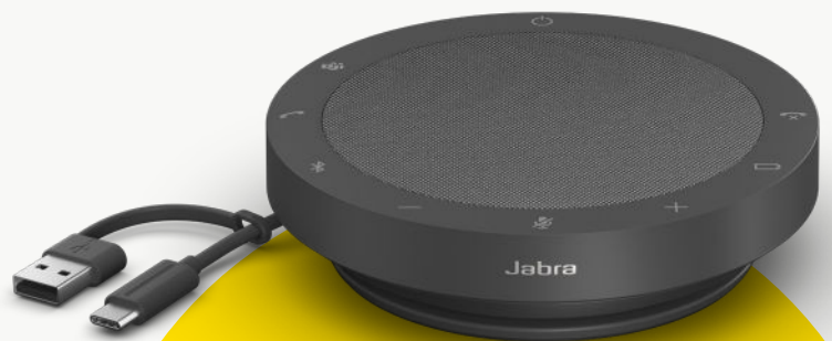
MS TEAMS &amp; UC VARIANTS

We consider sustainability carefully at every stage of product development. The casing of Speak2 55 is made with over 50% sustainable materials**, and has a number of built-in parts that can be repaired or replaced. Better sustainability = longer speaker life = great calls for you and your team for years to come.