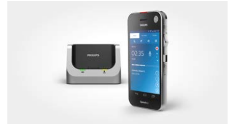
SpeechAir smart voice recorder