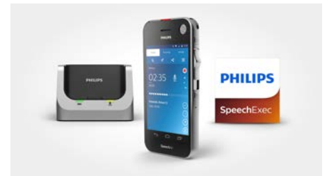
SpeechAir smart voice recorder SpeechExec Pro Dictate workflow software